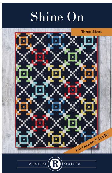
Shine On Item #: SRQ200P Wholesale: $5.00

Designed for confident beginner to intermediate quilters, the Dynamic Duo collection offers quilt patterns that combine two quilt block designs to create impressive secondary designs. Patterns include directions for three sizes