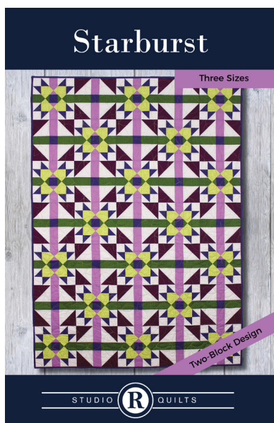
Starburst Item #: SRQ203P Wholesale: $5.00