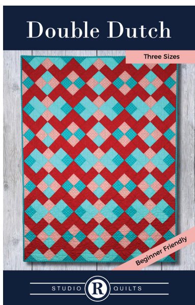
Double Dutch Item #: SRQ204P Wholesale: $5.00

Two quilt blocks combined to make complex looking secondary designs. Perfect for advanced beginner to intermediate quilters. Easy to kit and make great class projects.