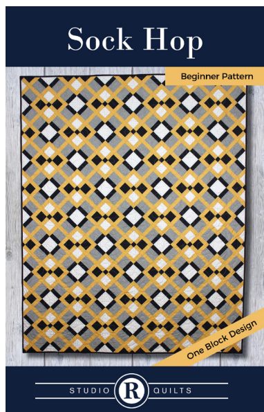
Sock Hop Item #: SRQ104P Wholesale: $5.00

One block patterns that make a throw size quilt. Perfect for beginners and an excellent choice for classes.