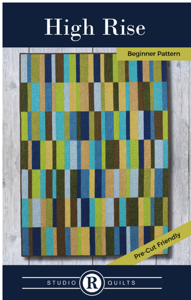
High Rise Item #: SRQ100P Wholesale: $5.00

Designed specifically for beginner quilters, the Skill Builder collection offers quilt patterns to help improve quilting skills and gain quilting confidence. Patterns create a throw size quilt using one block design and basic construction skills.