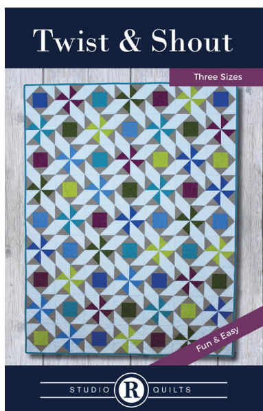
Twist & Shout Item #: SRQ201P Wholesale: $5.00