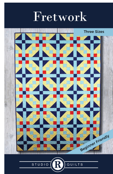
Fretwork Item #: SRQ202P Wholesale: $5.00