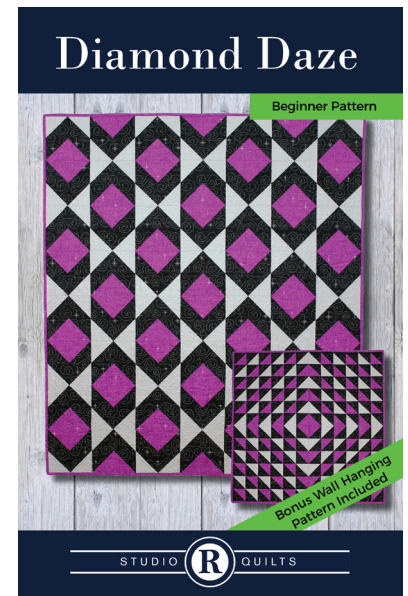
Diamond Daze Item #: SRQ102P Wholesale: $5.00