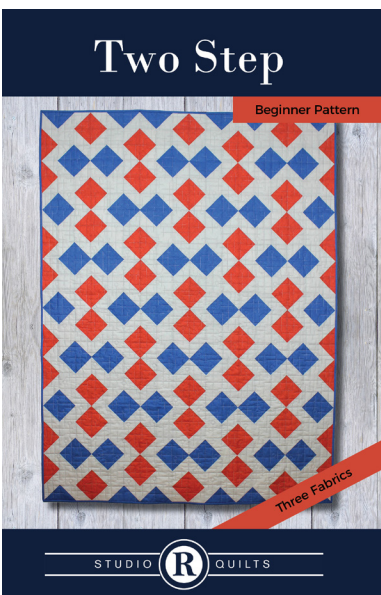
Two Step Item #: SRQ103P Wholesale: $5.00